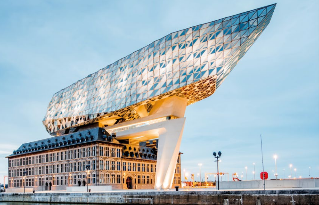
Antwerp - The Port House