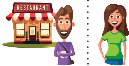
There is no common property!